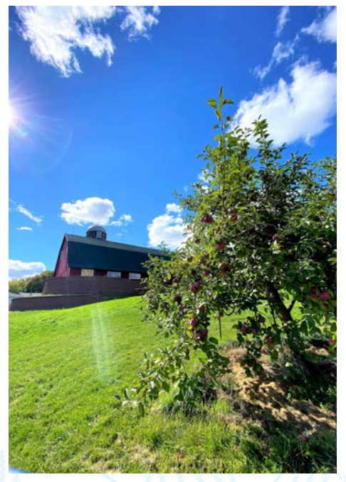
17325 Pleasant Valley Rd, Shafer

Take a walk through the orchard, pick a pumpkin and make friends with goats and "Pip" the black cat at Pleasant Valley Orchard. Stop in at the Appleshed for vour favorite Minnesota Grown apples, freshly-baked goods, gift shop, and enjoy live music on select weekends in September and October!